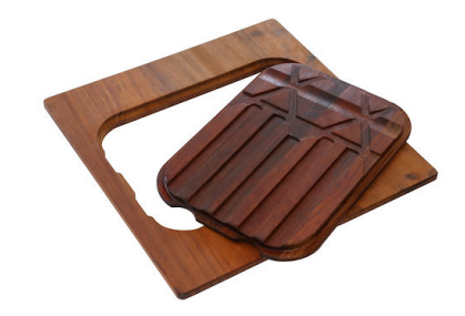
PLANCHE DE DECOUPE DOUBLE IROKO