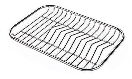
GRILLE PORTE-ASSIETTES INOX 25x35