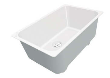
CUVETTE PLASTIQUE BLANCHE

A154 F00 * only in combination with the accessory A644 F04